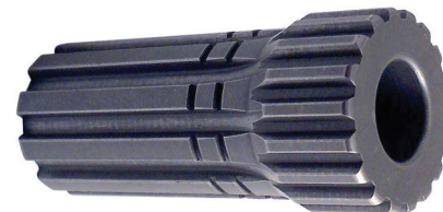
INPUT SHAFT P/N 62409