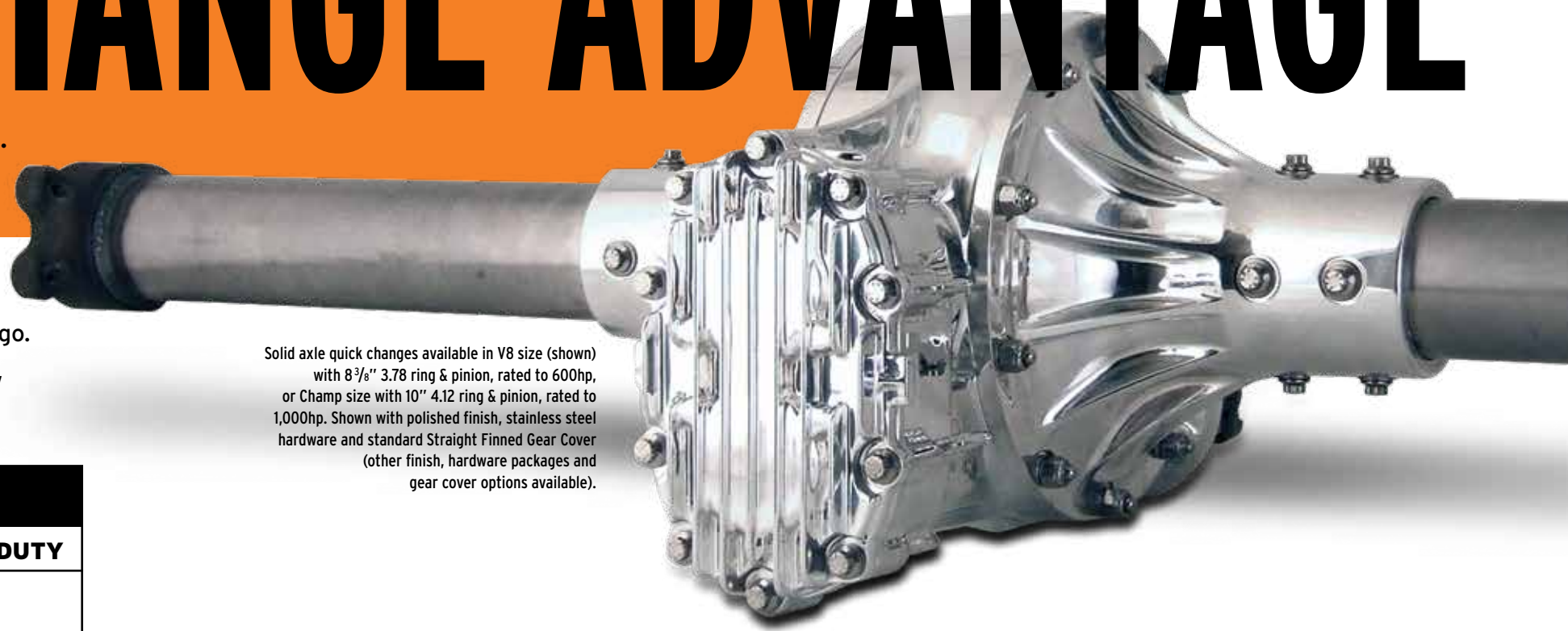
Solid axle quick changes available in V8 size (shown) with 8 3/8" 3.78 ring & pinion, rated to 600hp, or Champ size with 10" 4.12 ring & pinion, rated to 1,000hp. Shown with polished finish, stainless steel hardware and standard Straight Finned Gear Cover (other finish, hardware packages and gear cover options available).

It's tough to beat the mechanical good looks of a quick change rear end. It's the kind of detail that really grabs eyeballs when you look under (or in) the bed of a classic truck. But the real beauty of a Winters Quick Change is their versatility and strength. From cruising the highway to ripping around town or the track, you can change rear gear ratios in about 10 minutes. Just pop the gear cover, swap the gears and go. And with solid axle and IRS options that can handle 1,000+ horsepower, there's a quick change for every custom or racing truck build.