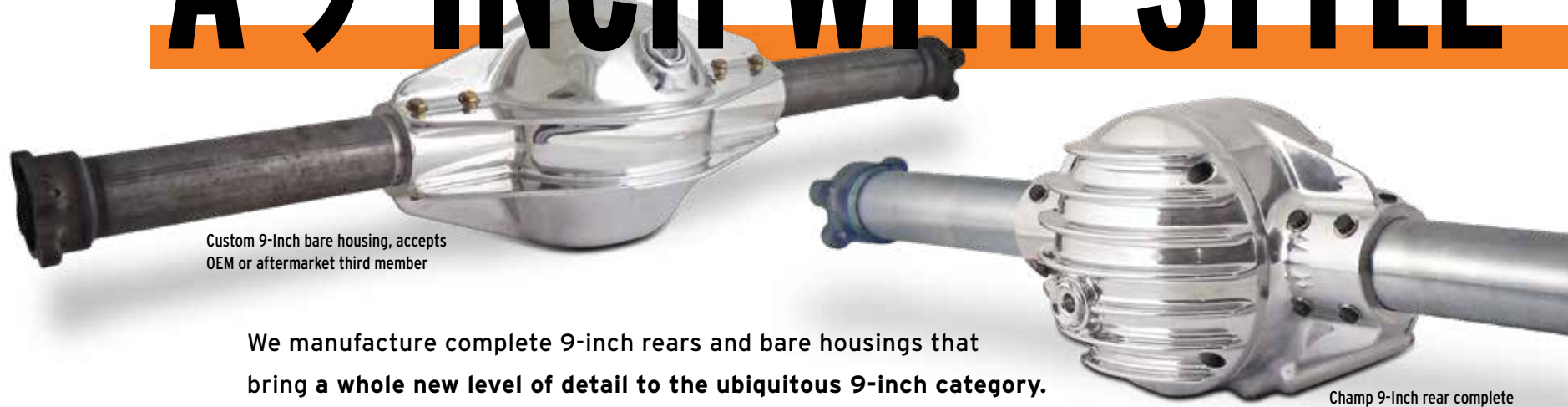
Custom 9-Inch bare housing, accepts OEM or aftermarket third member