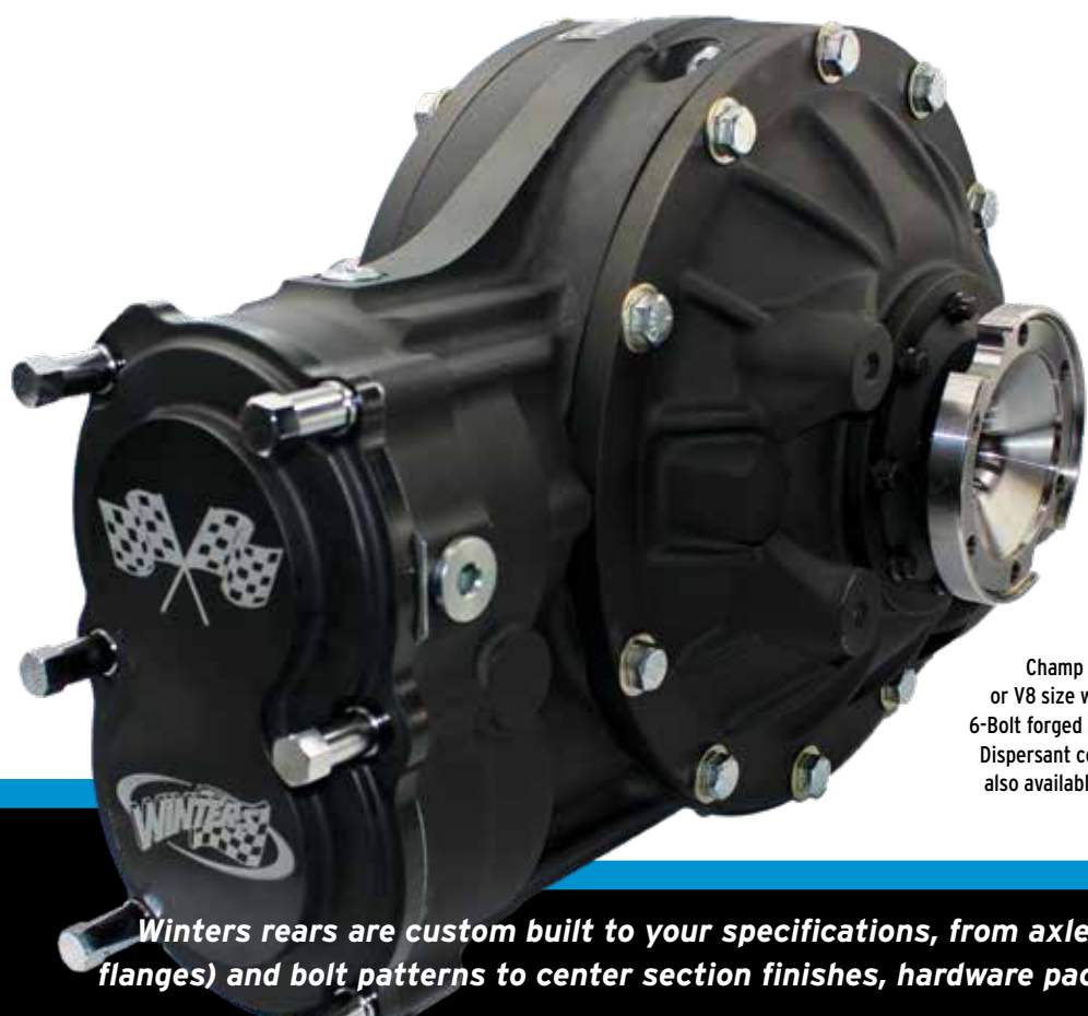
Independent quick changes available in Champ size (shown) with 10" 4.12 ring & pinion, or V8 size with 8 3/8" 3.78 ring & pinion. Shown with 6-Bolt forged aluminum gear cover and black Thermal Dispersant coating. Natural Cast or polished finishes also available, as well as 10-bolt gear cover options.